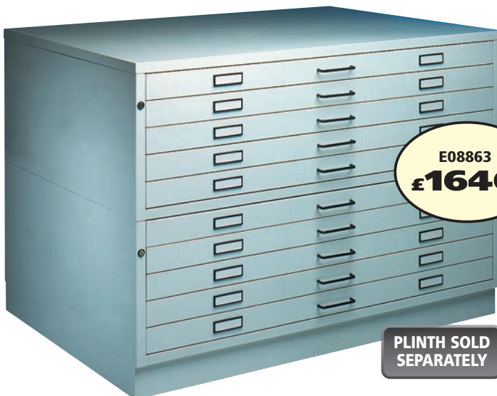
PLINTH SOLD SEPARATELY